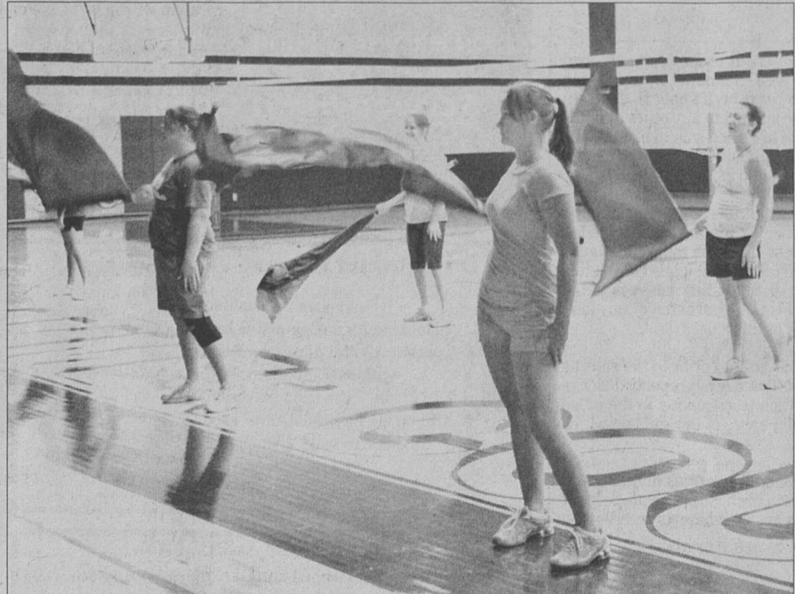
The Rice High School Flag Corps get ready for the upcoming season during workouts this week.